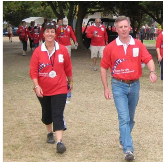
Participating in Relay for Life

Local health services continue to fall well below an acceptable level, with Frankston Hospital failing to achieve, or even come close to the State's own benchmarks in both the Emergency Department and in Elective Surgery.