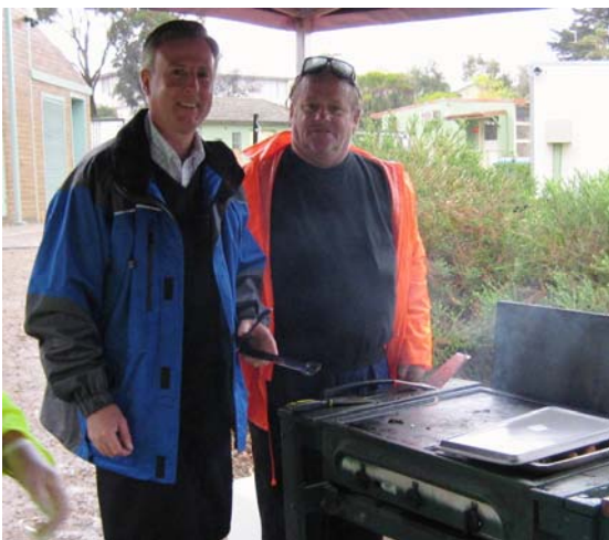
Barbequing at Mornington Peninsula Youth Enterprises

Local fire protection has not unexpectedly been a big issue following the tragic events of Black Saturday. Much of the electorate is at risk from wildfire, particularly the wooded